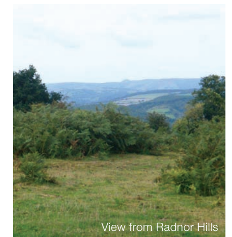
View from Radnor Hills

Go down and over to the left, to Oaker Coppice and follow down round the edge of the woodland to its lowest point, then continue down slightly left to where you parked. ■