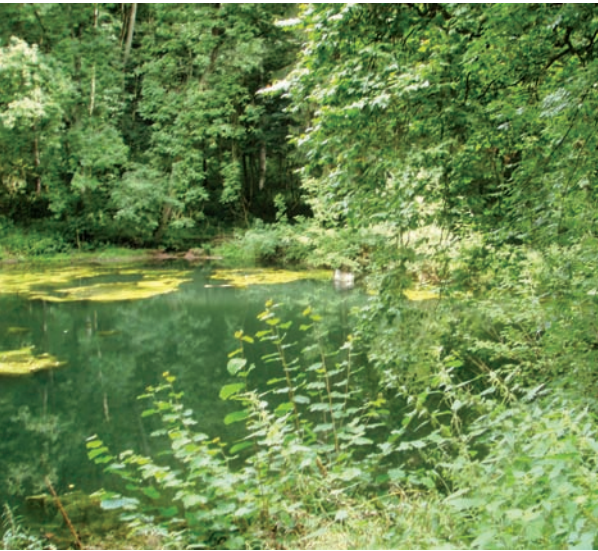
Above Fishpools Valley

Right The skeleton of an ancient tree seen en route