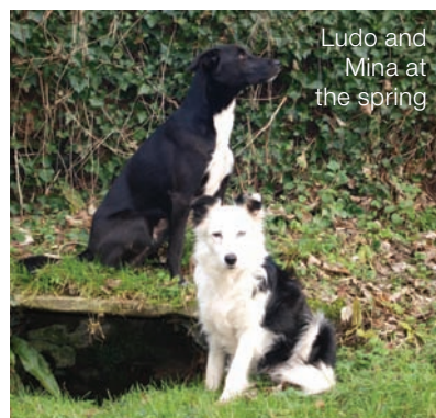
Ludo and Mina at the spring

Keep walking with the hedge on your right, in the top field, until you reach a stile. Turn left across to the hedge. With it on your left walk to its end, follow the marker left and through a gate, then immediately right through a second.