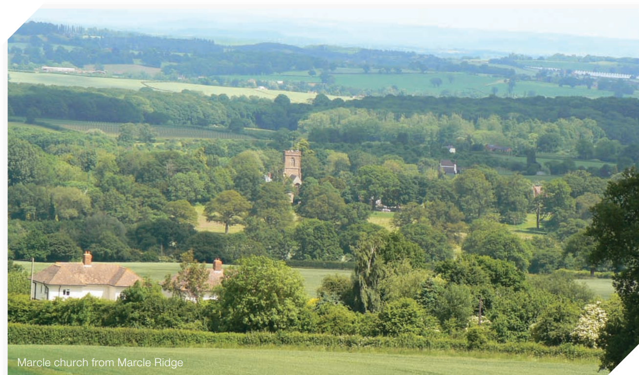
Marcle church from Marcle Ridge

2. Cross another stile and go straight on. Just past the stile there is a sad sight, a large pile of redundant hop poles. Do not enter the field with the hop poles but continue straight on with a new hawthorn hedge on the left. Cross a stile with a horse jump alongside it into another field. Pass between a tree and the hedge then veer 45 degrees left towards a bridge with stiles half hidden in the far hedge. On reaching the bridge, turn left