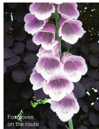
Foxgloves on the route

"I do not like thee, Dr Fell The reason why I cannot tell But I know and know full well I do not like thee Dr Fell"