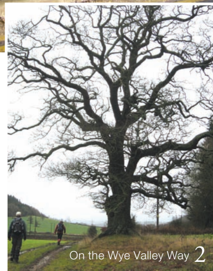
On the Wye Valley Way 2