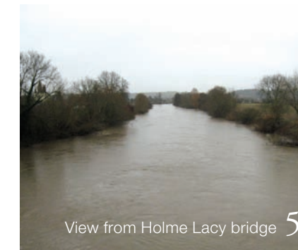
View from Holme Lacy bridge 5