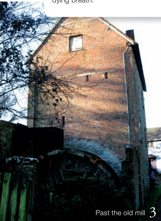
Past the old mill 3

WVW (photo 2) passing several cottages and a farm.