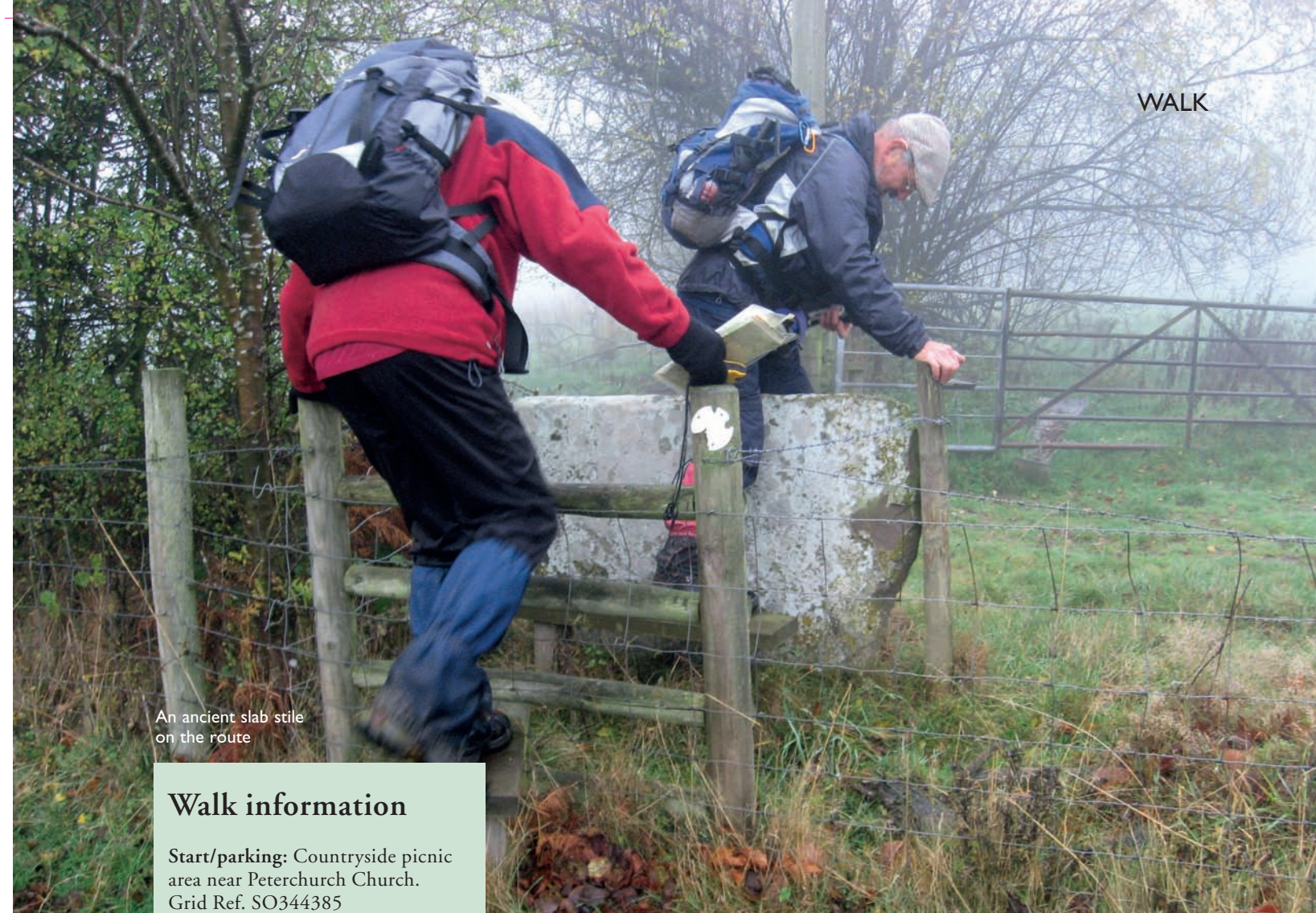
An ancient slab stile on the route

3 This is a crossroad of footpaths. Following in the same direction, keep the hedge to the left and go through some woodland to emerge into an enclosed track with two gates which have to be passed through. Continue with the hedge on the left, through another gate and follow the field edge to the right to cross a stile on the left, turn left and then turn right onto a stone track, ignoring the first right with the cattle grid. Keep following the stone track until it takes a turn right and then go straight on the brideway along the edge of the wood. With the wood on the right, ignore any accesses into the wood until reaching a stile on the right.