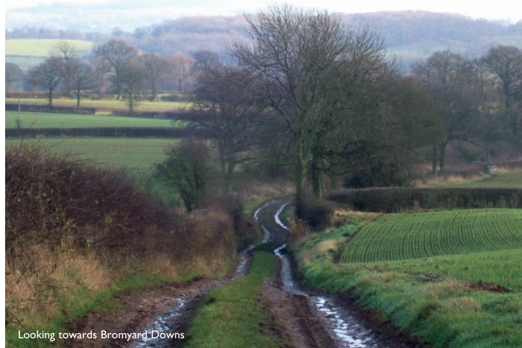
Looking towards Bromyard Downs

Go through the lych-gate and cross a stile on the right. Turn left and go straight across the field. At the end of the field you come to a footbridge. Cross it and turn sharp right along the field edge. At the corner turn left along the hedge and find a double stile on the right corner. Now carry straight on across the field, maintaining your height (not going down into the dip), join the hedge on your right and reach a