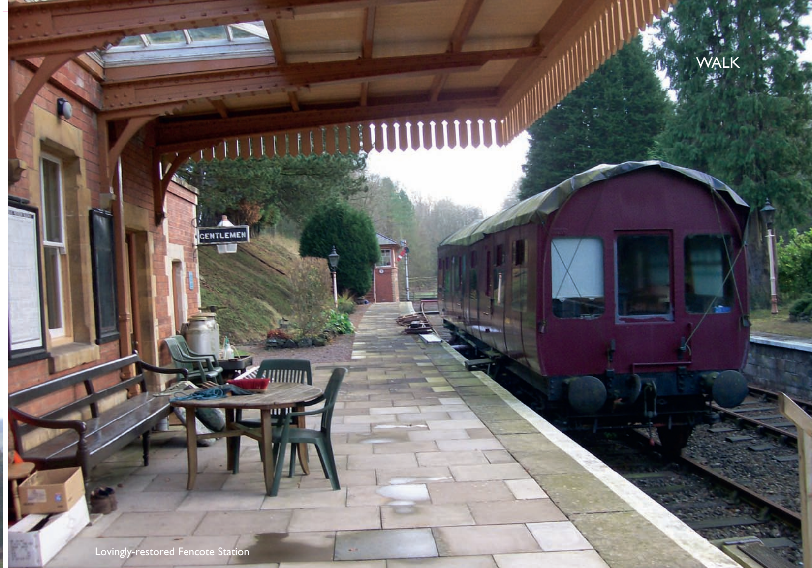
Lovingly-restored Fencote Station

3 Now turn immediately right along a narrow lane, passing Rowden station. Soon you reach Great Wacton. Go