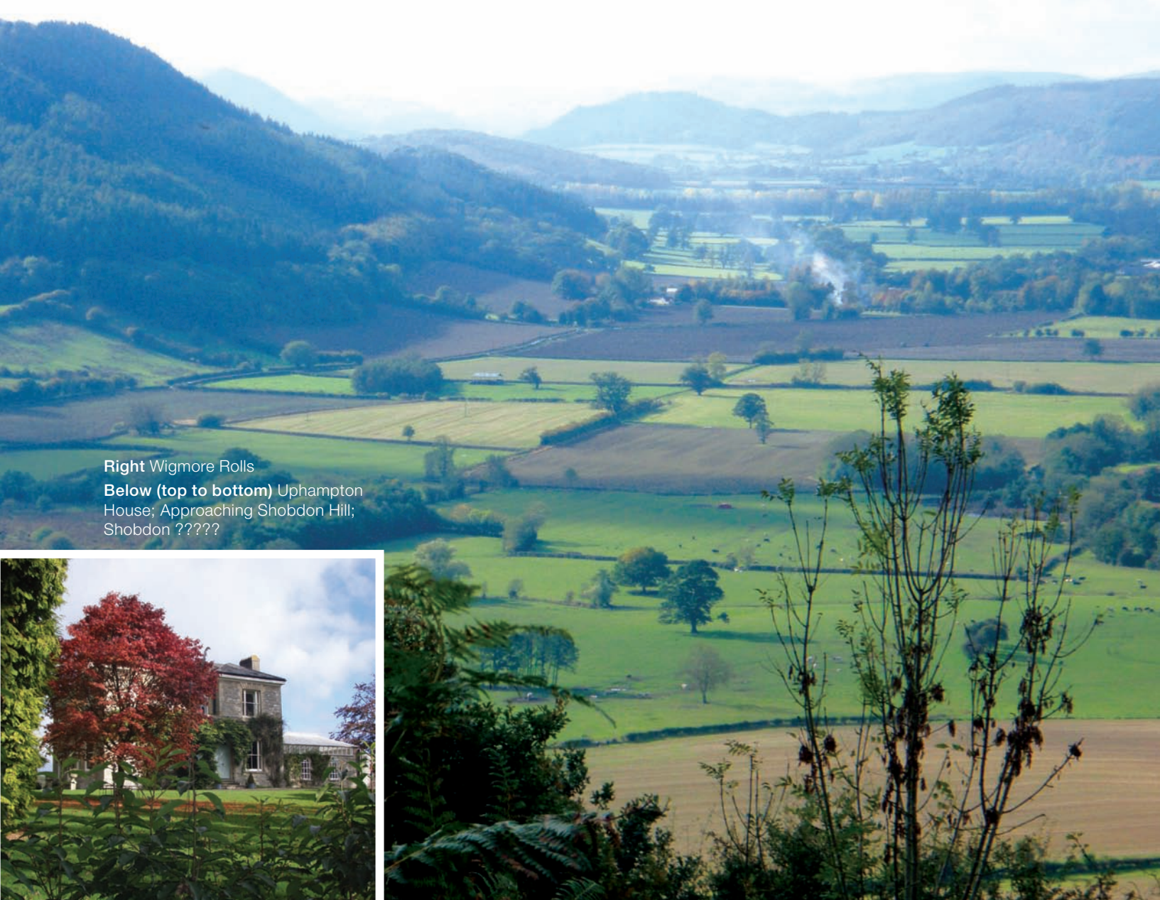
Right Wigmore Rolls Below (top to bottom) Uphampton House; Approaching Shobdon Hill; Shobdon ?????