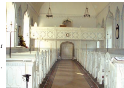
Below left and left Shobdon Church

dampish area to walk through. To the right, hidden by the trees is Pearl Lake, one of the largest areas of open water in Herefordshire. Follow the fence, crossing the stiles, and winding your way through the gorse bushes to the sloping area where some horse lanes have been marked off. Walk straight over to the stile and walk along the top of the field, then bear left through the gap, at the copse, to continue walking with the trees on the right, to the woods ahead. Cross the track that comes down from your left, to enter the woods, at first on a small grass track that very soon opens up to a well defined path up through the wood. After crossing the stile, on the right, follow the track up left. The Motte, of what had once been Shobdon Castle is to your right. There are some very large oak trees growing round the edge. Go through the gate and right to the car park.