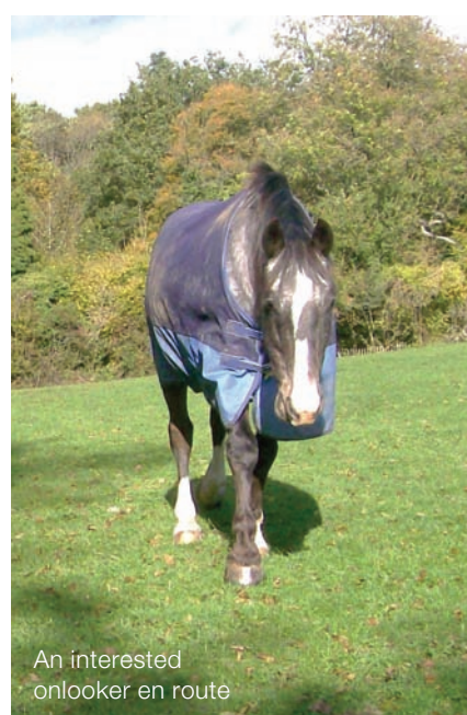
An interested onlooker en route